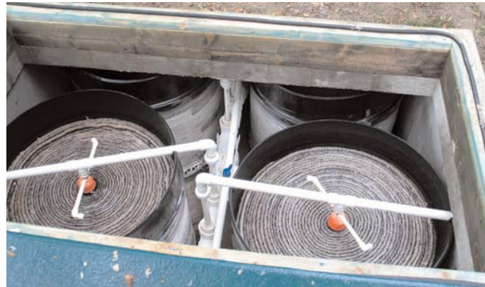
Coils of textile and peat receive aerobic effluent which re-circulates.

is to protect the waters of Lake Skaneateles, the water supply for the city. Eric has Federal money to spend on emerging technologies. Since New York does not force the same standards for repairing a system as for new systems (unlike PA) he is able to fix the problems he encounters.