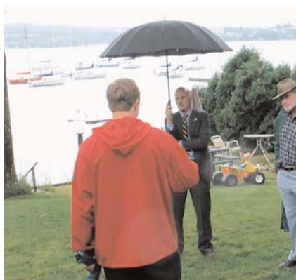
Small lots along the lake present unique challenges. Here a shallow drainfield provides final treatment of sewage pre-treated by advanced aerobic systems. This lot used to have failing seepage pits. Now the closely monitored system does not pollute the clean lake waters.

Above is a filter system that re-circulates effluent through a textile/peat combination filter. On a timed dosage basis, the very clean effluent is pumped for dispersal into the drain field under the driveway. Under old-fashioned prescriptive codes, none of this is allowed. The system is too close to the house and the property lines. The old system was failing, the new system produces clean water. There are 2300 homes around the lake. 300 are on city sewer, 75 have composting toilets, and the rest have various onsite systems. There are restaurants and other businesses just as you would expect. Each of them is a potential threat to the clean lake waters. One site uses three open bottom peat filters for sewage treatment. Effluent is monitored and it is clean. Another site had failing seepage pits (below), Eric's team added a shallow drainfield by overlaying the existing soil with perforated pipe and sand. Using modern technol-