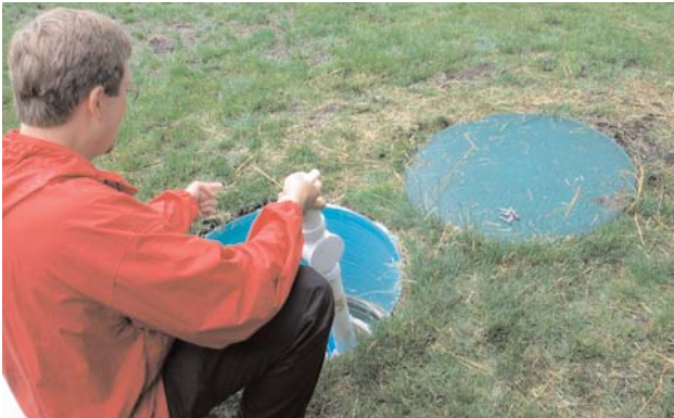
Special filter/screen in STEP chamber keeps solids out of the drainfield. All tanks need an effluent filter.

ogy, the septic tank pre-treats the sewage from the house. Solids, settle and are digested. Fats and grease float, the middle layer is treated biologically by anaerobic bacteria that digest and reduce the bio-load. The second chamber of the tank is a pump chamber (STEP System) that repeatedly re-cycles the effluent through packed bed