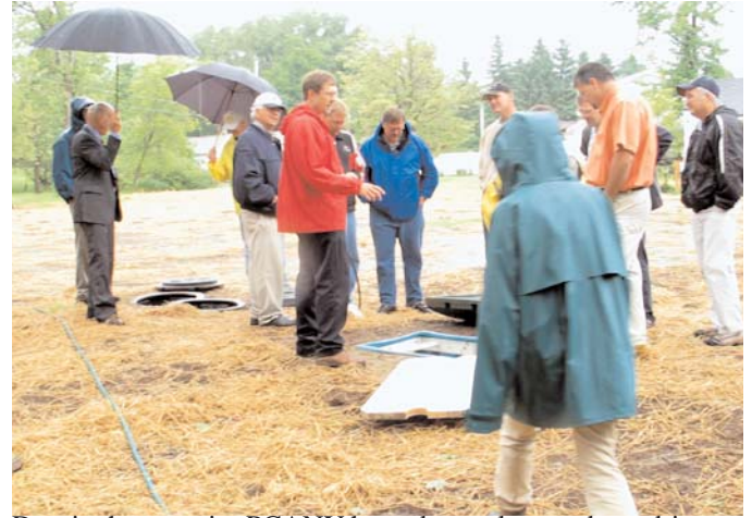
Despite heavy rain, PCANY hosted tour learns about drip dispersal on the shore of Skaneateles Lake.

City of Syracuse, Watershed Protection 315-473-2629