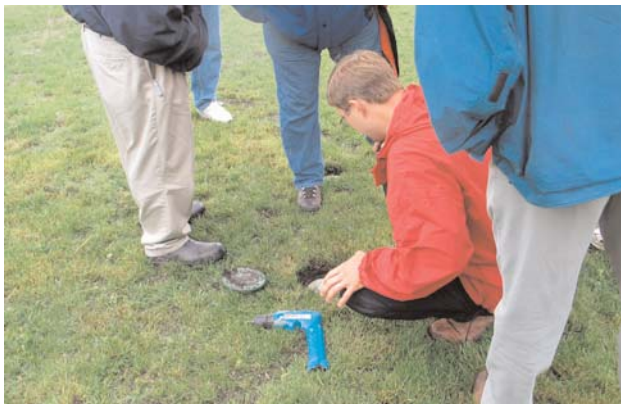
Accessible inspection ports allow monitoring of the shallow drainfield's performance in the lakeside onsite system.