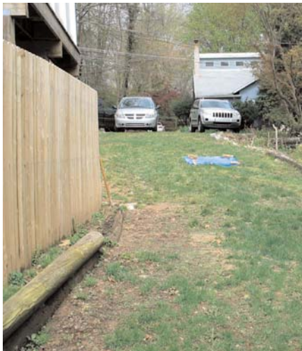
Small narrow site . Blue tarp keeps rain out of tank which requires weekly pumping

In Pennsylvania, there is a site where raw sewage is flowing across the ground and downhill into a creek feeding the Philadelphia water supply. 100 years ago the area was dotted with country retreats for city people looking to escape the heat. Now the cabins have been enlarged to four bedroom homes on quarter acre lots. An old "tank" remains uncovered to allow for weekly pumping. Two teenagers and two adults conserve water by taking two minute showers and only flushing when absolutely necessary. I can fix it. A